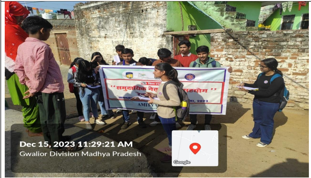
Dec 15, 2023 11:29:21 AM Gwalior Division Madhya Pradesh