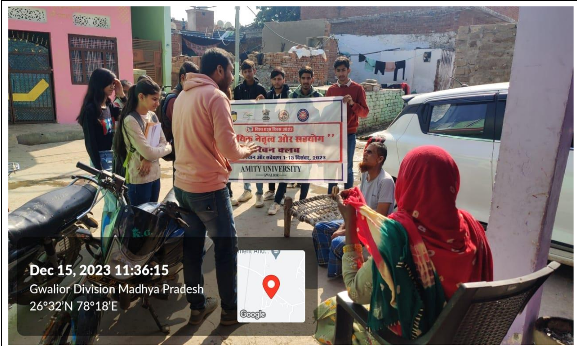
Dec 15, 2023 11:36:15 Gwalior Division Madhya Pradesh 26°32'N 78°18'E